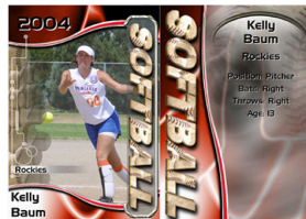
Trading Card (Front & Back)